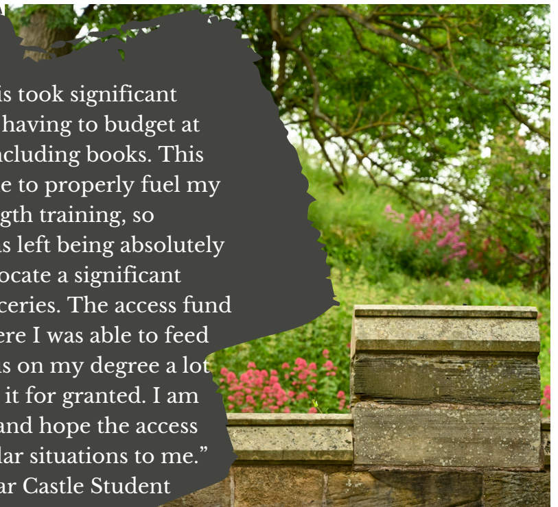
An image of Castle walls by Bex Harvey