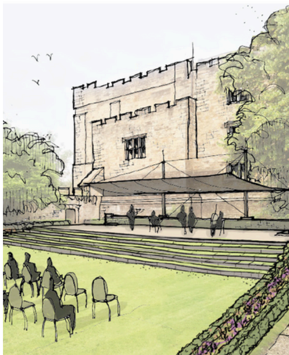
Architect's drawing of redeveloped Fellows Garden