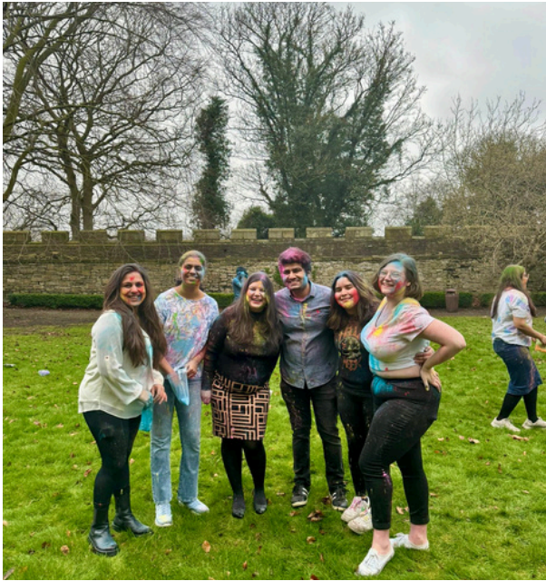
Students taking part in MCR organised Holi festival