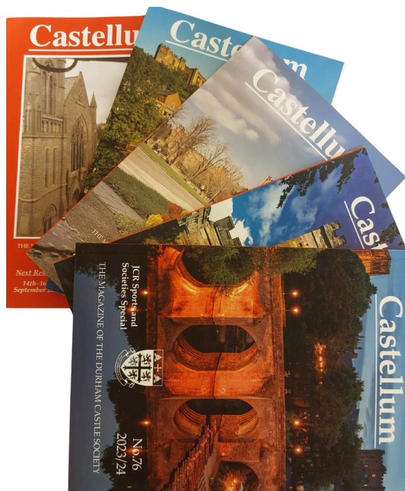
Some of our recent issues of the Castellum magazine